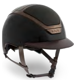
Dark Brown HHE00016.231