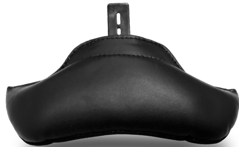
Lady Fit System HAC00002