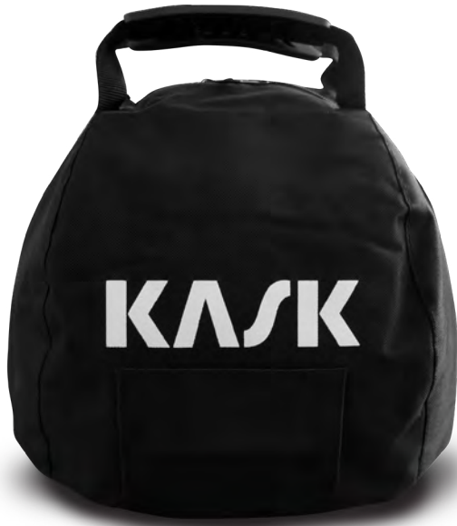
Helmet Bag UAC00003