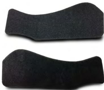
Lateral Inserts HAC00001