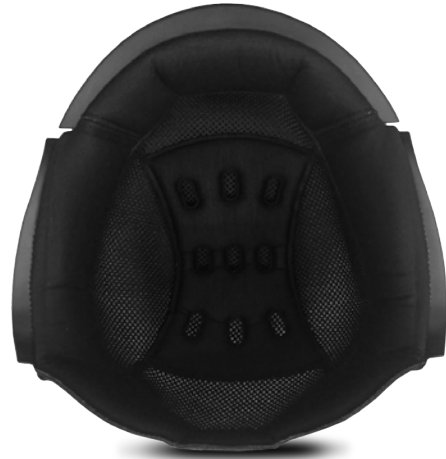
Inner padding HPA00001