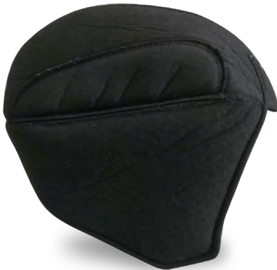
Winter padding HPA00003