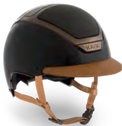
Light Brown HHE00016.319